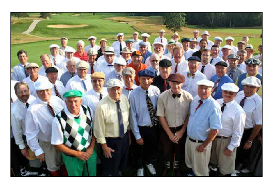
2011 U.S. Hickory Open French Lick, Indiana