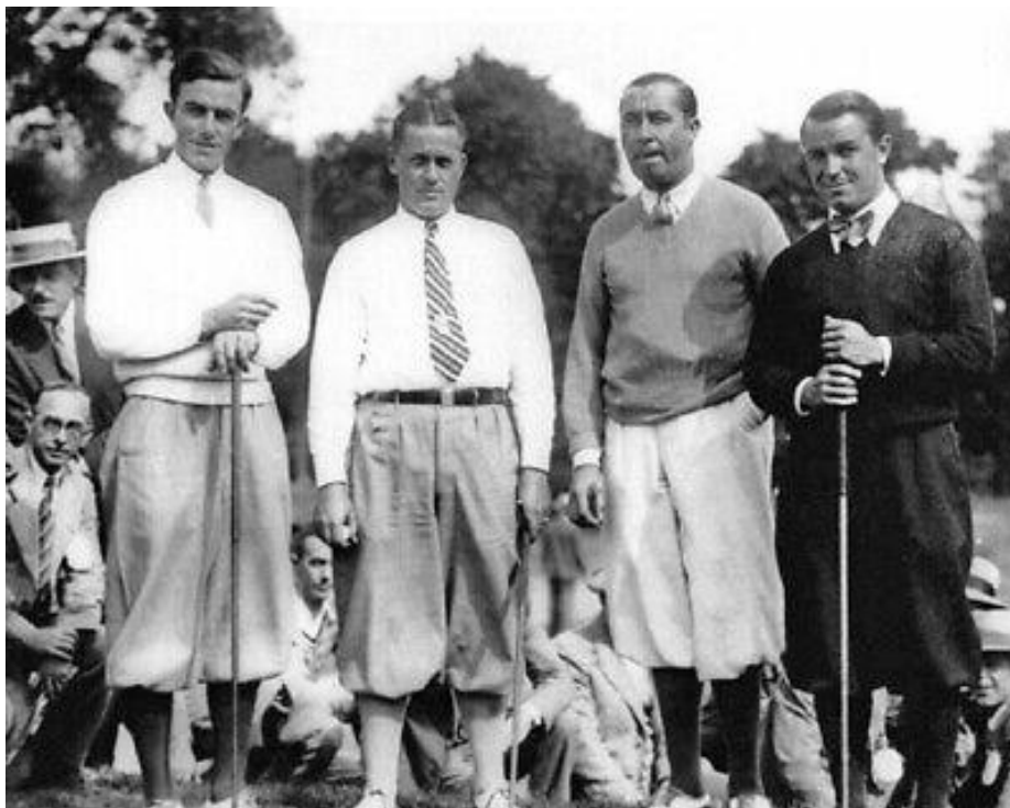
(Johnny Farrell, Bobby Jones, Walter Hagen & Gene Sarazen. All competed at Belvedere Golf Club.)

In modern times, it has hosted Billy Casper, Jack Nicklaus, Andy North, Loren Roberts, Meg Mallon, Beth Daniel, Lanny Wadkins and Tom Watson. - Tom has been a member at Belvedere for over three decades and still makes trips back.