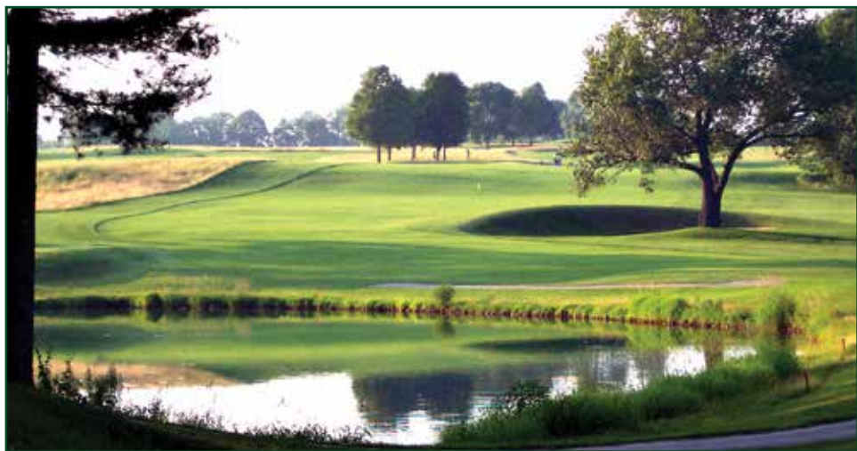
VIEW DOWN THE 15TH at Lawsonia and a rare sight of water, other than Green Lake.

Hickory Open here. You have to put your ball on the green in the right spot to have a chance at par or better. A score right around even par or maybe even a few over par will win.”