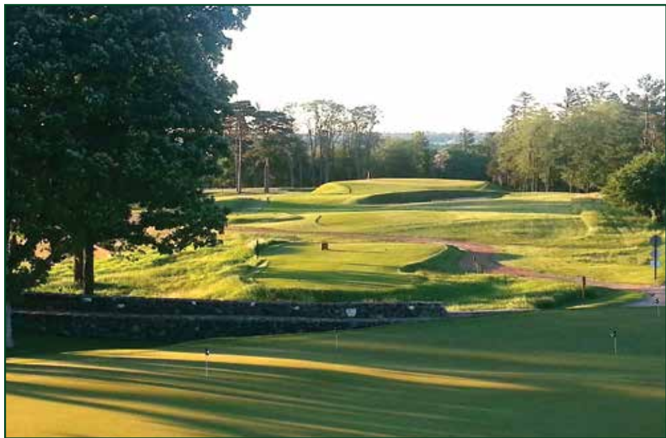
10TH HOLE at Lawsonia shows the elevated green in the distance. No breather here.

“It also has the ability make you pay severely for your mistakes,” he says. “Fairways and greens will be a secret to winning the U.S.