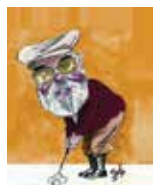
Tad Moore Hickory Classics