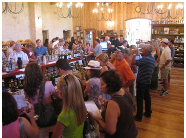
One of the many pools of Hearst Castle and a typical Paso Robles wine tasting room.