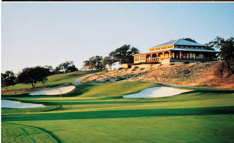
Hunter Ranch Clubhouse and bird's eye view of Morro Bay. Golf Course in foreground.