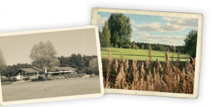
FRIDAY, 14th AUGUST 2020

12.00 - 14.00 start Four Ball-Best Ball-Matchplay with 3/4 Handicap »Germany against the Rest of the World« over 18 holes